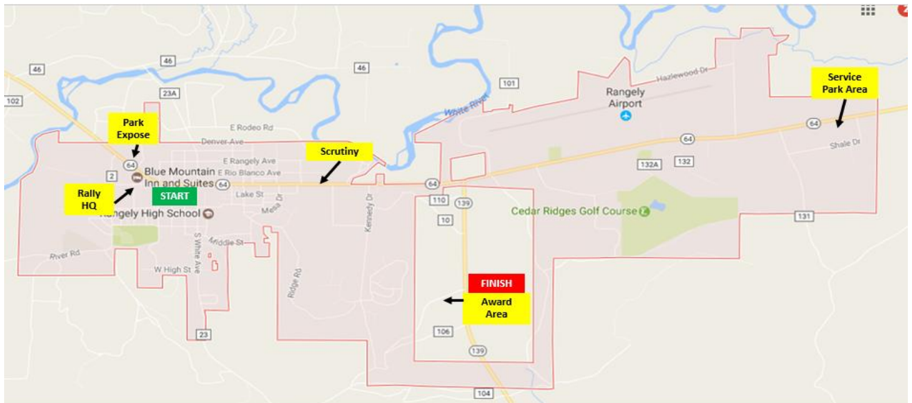
Regional Map – Rangely, Rio Blanco County